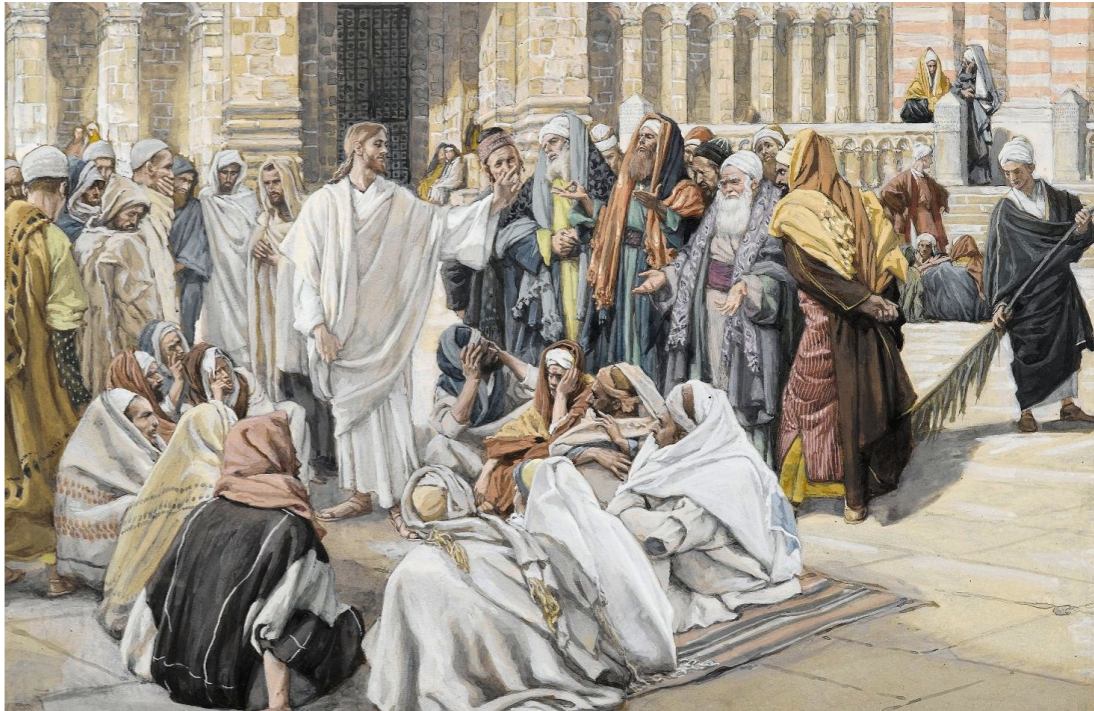
Jesus and the Pharisees (1886-1894) James Tissot (1836-1902)

The humour in today's Gospel is wonderful. The scribe says to Jesus, "Well spoken, Master, what you have said is true: that he is one and there is no other..." The scribe, unbeknown to him, tells the incarnate Son of God that he is speaking the truth. It was God, Father, Son and Holy Spirit, who first gave to the people of Israel the Shema Yisrael which we hear in today's reading from Deuteronomy (6: 4): "Listen [or, more accurately, "Hear", which, fortunately, is the translation in the new Lectionary ] Israel: The Lord our God is the one Lord." The Shema is a declaration of faith in one God. It is incorporated in the Catholic Liturgy, read during Compline (Night Prayer) every Saturday night, thereby drawing to a conclusion the day's prayers. As disciples of the Risen Lord we should "Let these words I urge on you today be written on your heart", following God alone rather than the many false gods proffered to us by the world.