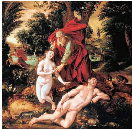
The Creation of Eve