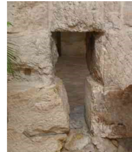
The 'Eye of the Needle Gate' Jerusalem?

The illustration is of a narrow hole cut in a wall in Jerusalem, but it is not called the Needle Gate. In fact, there was no such gate in our Lord's time. The wall in which this gate appears was built hundreds of years after Jesus' time. The gates of Jerusalem were destroyed in 70AD and later rebuilt. Josephus, the 1st century Jewish historian, wrote about the destruction of Jerusalem (but not the Western or Wailing Wall):