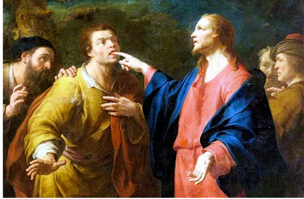
Christ Healing the Deaf and Dumb Man Domenico Maggiotto (1713-1794)

The healing of the man who is deaf and suffering from an impediment in his speech has a very physical nature: Jesus puts his fingers in the man's ears and touches his tongue with spittle. This teaches us two things. First, our Lord is not afraid of our physical nature, which is wonderfully illustrated in this painting by Maggiotto. On Christmas day we hear of how "the Word became flesh and dwelt among us" (John 1:14). God is not afraid of us, loving us despite our sins and our failings. He came to heal us, to restore us. This leads us to the second matter about our Lord's healing of the deaf and dumb man. Through word and touch, Jesus brings him into the hearing and speaking world of personal communication. In this experience the man represents all believers. Apart from the grace of God we are 'deaf' to the Word of life spoken to us by the Creator. By opening our ears Jesus gives us the capacity to hear his life-giving Word, which he then speaks to us in the Scriptures proclaimed by the church: "The eyes of the blind shall be opened, the ears of the deaf unsealed, then the lame shall leap like a deer and the tongues of the dumb sing for joy" (Isaiah 35: 5-6) In this way Jesus enables us to join in the chorus of the community of faith: "He has done all things well."