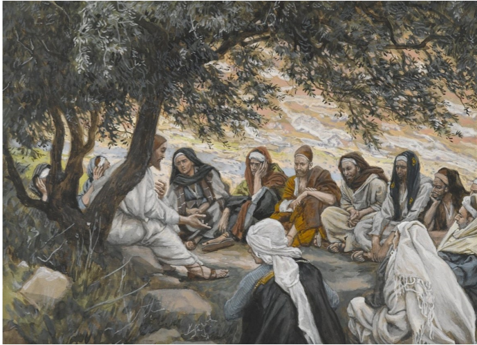
The Exhortation to the Apostles (1886-1894) James Tissot (1836-1902)

All of us have met people who do not profess the Christian faith but who, by their way of life, nevertheless put into action the second great commandment, "You shall love your neighbour as yourself" (Matthew 22: 39). I have never forgotten that when my mother died I received great help from a work colleague who would never dream of going to a church except to attend the funeral of someone whom he knew. Jesus instructs his disciples not to pass judgement on those who, while not seeming to be his disciples, are nevertheless working to bring about the kingdom of God. Instead, he warns them to first examine their own actions and thoughts to see if they are truly his disciples. As we pray during the Solemn Intercessions on Good Friday: