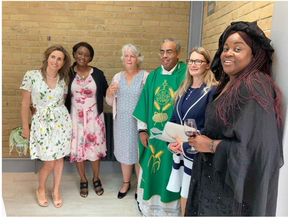
Confirmation group 20th June 2021